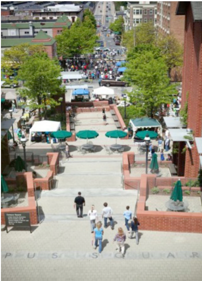
Figure 1. Campus Square served as a great transition from the campus to the community when it was built in 2002.

(see Figure 1). Campus Square blended the border of the town and the university by placing 250 student residents, a public parking garage, and a small retail sector that included the Lehigh Bookstore on a section of campus that abuts the city's commercial district. Community leaders had said Lehigh was turning its back on the community since all the buildings constructed in the 1960s and 1970s faced away from the community. Campus Square became a gateway to the community; significantly, it was the first new construction in decades that faced toward the community. That symbolic gesture was a watershed moment in sending the message that the isolationist philosophy at Lehigh University was changing.