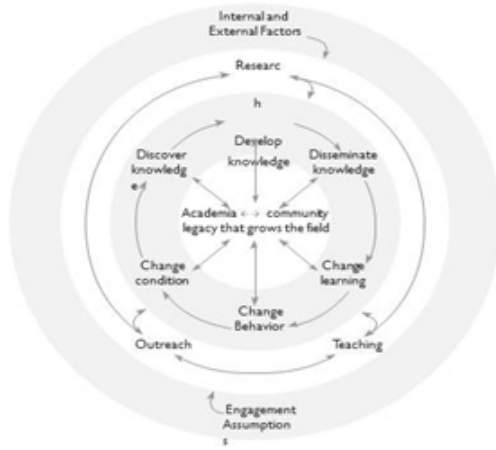
Figure 1. Franz Engaged Scholarship Model

model. The goal of this work was to help academics and administrators better understand and reward wider types of scholarship, in particular scholarship beyond research and teaching ( UniSCOPE Learning Community 2008 ). The three types of scholarship in this model are teaching, research, and service, with discovery at the heart of all three and integration and application woven throughout. The UniSCOPE learning community has created publications and led workshops and dialogue on this model of scholarship. The community feels this effort continues to be a work in progress ( 2008 ).