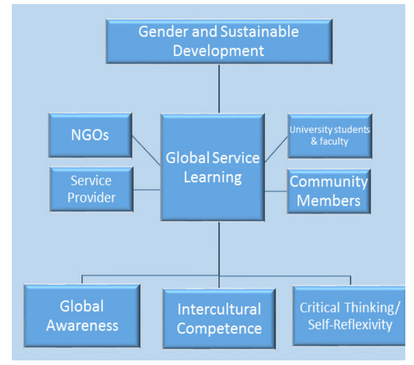
Figure I.An Overview of Global Service-Learning in Tanzania Program