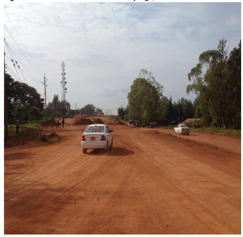
Figure 3. Local Road Construction in Kayanga, Tanzania

The transformational learning that takes place in GSL through fieldwork, visits to cultural sites, and interactions with local people and institutions coincides with students' increased awareness and understanding of global issues and processes. Hartman and Kiely's (2014b) work on global citizenship resonates with the dilemma of students who engage in these experiences in ways that make universities "develop international structures that cater to U.S. students' wishes [and mimic] the earlier structures of colonialism" (p. 216). Yet there are also accounts of students' obtaining a heightened sense of global social responsibility or global citizenship (Hartman & Kiely, 2014a). These are invaluable lessons in tracking the effect of service-learning and experiential learning. By engaging with the communities and seeing gender relations and power dynamics firsthand, students are able to integrate the scholarly material and coursework with direct experiences in the community and region. They also understand the relationship between local and global issues, such as the impact of colonial rule on political, economic, and ethnic divisions in Rwanda, and investment by Chinese construction firms in rural Tanzanian infrastructure.