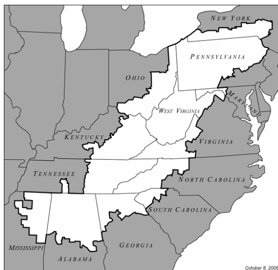
Figure 1: Map of Appalachia

increased prevalence of behavioral risk factors (Halverson, Ma, & Harner, 2004). In terms of cancer, Appalachia has elevated incidence and mortality from cancers of the lung, colon, rectum, and cervix, as well as a high percentage of cancers diagnosed at a late stage when the prognosis is poor (ACCN, 2009; Huang, Wyatt, Tucker, Bottorff, Lengerich, & Hall, 2002; Lengerich, Tucker, Powell, Colsher, Lehman, Ward, Siedlecki, & Wyatt, 2005).